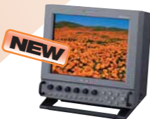
LMD-9030 (640x480 pixels) Standard SD-SDI