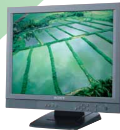
LMD-2010 (640 x 480 pixels)