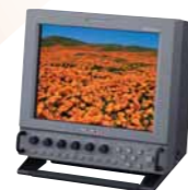
LMD-9050 (1024 x 768 pixels) Standard HD/SD-SDI