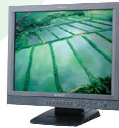
LMD-2020 (640 x 480 pixels)