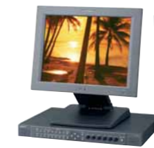
LMD-152 (1024 x 768 pixels) + MEU-WX2