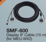
SMF-600 Display IF Cable (10 m) (for MEU-WX2)