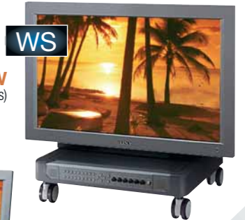
LMD-322W (1280 x 768 pixels) + MEU-WX2 + SU-559