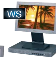
LMD-172W (1280 x 768 pixels) + MEU-WX2