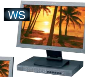
LMD-232W (1280 x 768 pixels) + MEU-WX2