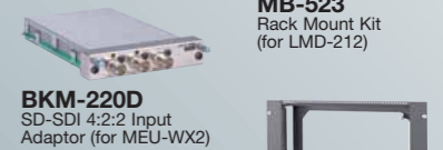
MB-523 Rack Mount Kit (for LMD-212)