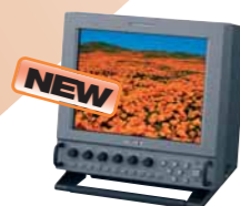
LMD-9020 (640x480 pixels) HD/SD analogue component input