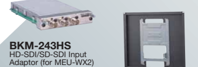
BKM-243HS HD-SDI/SD-SDI Input Adaptor (for MEU-WX2)