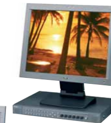
LMD-212 (1024 x 768 pixels) + MEU-WX2