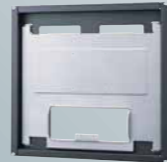
MB-527 Rack Mount Kit (for LMD-2020, LMD-2010)