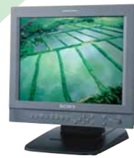
LMD-1420 (640 x 480 pixels)