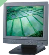
LMD-1410 (640 x 480 pixels)